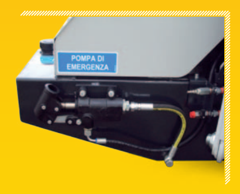
Emergency hand pump with ease of access and operation.