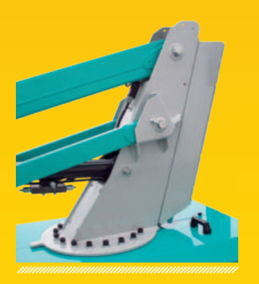
Rotating turret hosting hydraulic components of the platform's aerial section