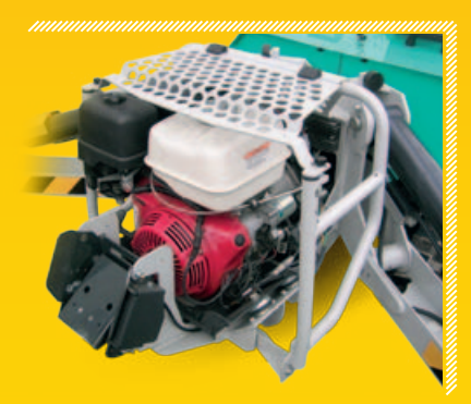
Engine guard enable high accessibility and impact's protection